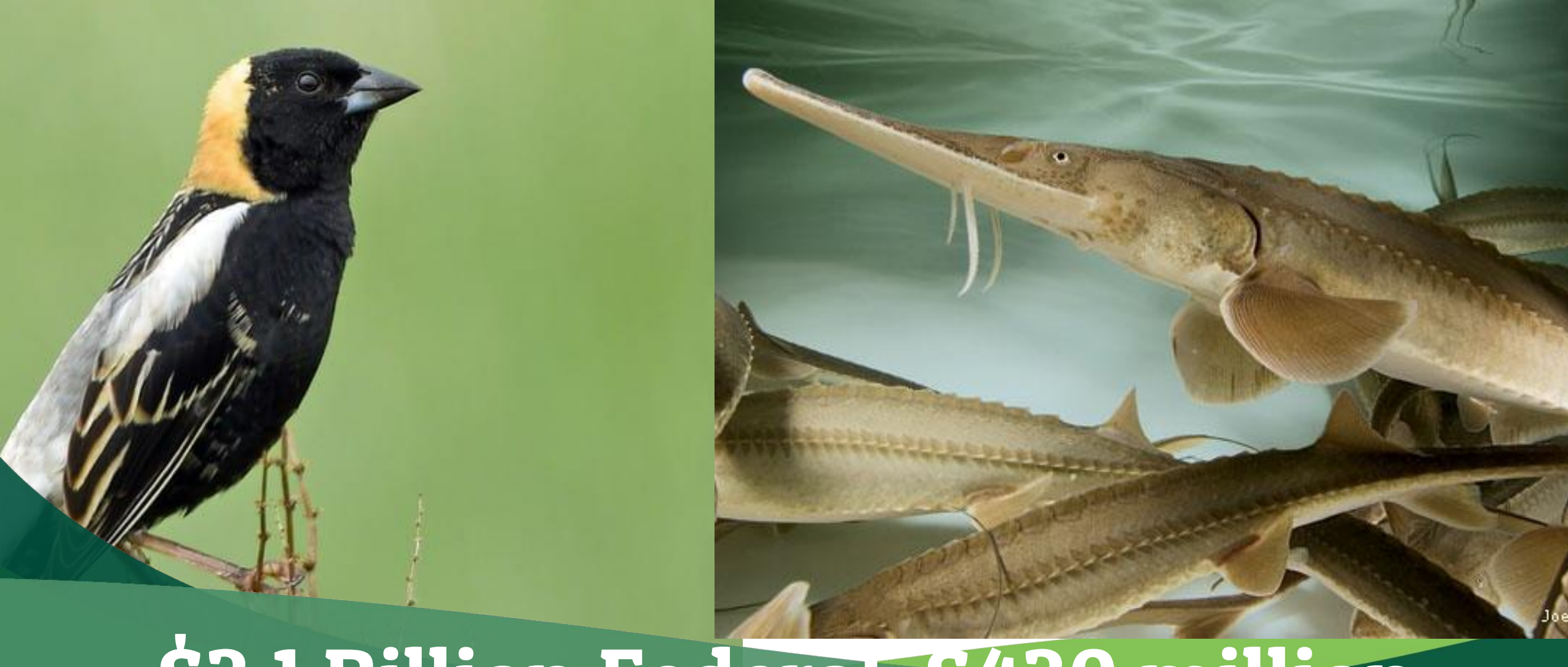
$3.1 Billion Federal, $430 million State